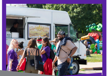
Food Truck Alley

A festival of food trucks, local soda, ice cream and more!